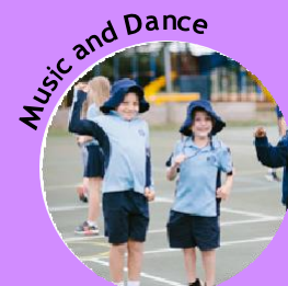
Music and Dance

In any one week, children could be participating in science experiments, active play, creative expression and more - we believe in learning through experience so that each child can grow into who they want to be.