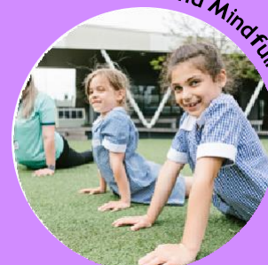
Yoga and Mindfulness