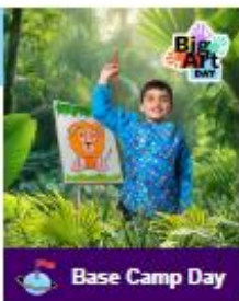
Base Camp Day